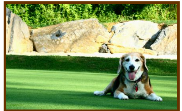
Even Roxie is finding this heat intolerable. She decides its best to just take a break.

to irrigate the greens, tees and fairways in one night, but now it takes us three nights to complete this work. It takes 3 full nights just to water the fairways. We try to get the greens and tees watered, but Mark has been coming in early because we just cant do it all in one night. The greens and tees have to be watered every other day in order to stay healthy.