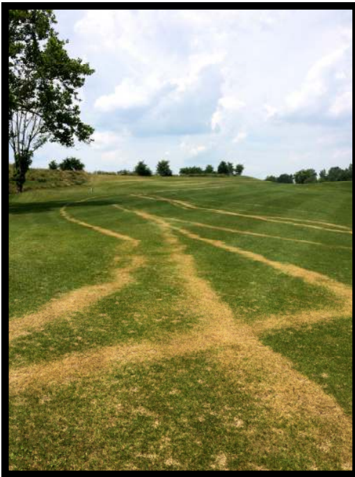
Damage to #15 Rock.

every day, always considering the playability of the course for the members and other customers. Moisture levels affect every aspect of the game, starting with sticking a tee in the ground, the roll of the ball down the fairway, how the greens hold a shot, and the speed of putts. We have made a lot of changes to the way we are watering the course.