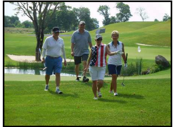
Member Outing: July 4th

We've not generated a note in a while. I apologize for being remiss. June was exciting for tournaments, both in the fundraiser department and then there was our Member Guest. You know, sometimes, well intentions can outgrow its ideology and the actual practice, well, let's just say, lessons learned. What we learn most from experience is that when proper communication is employed, many ill-effected consequences would otherwise be prevented or avoided altogether. 'nuff said.