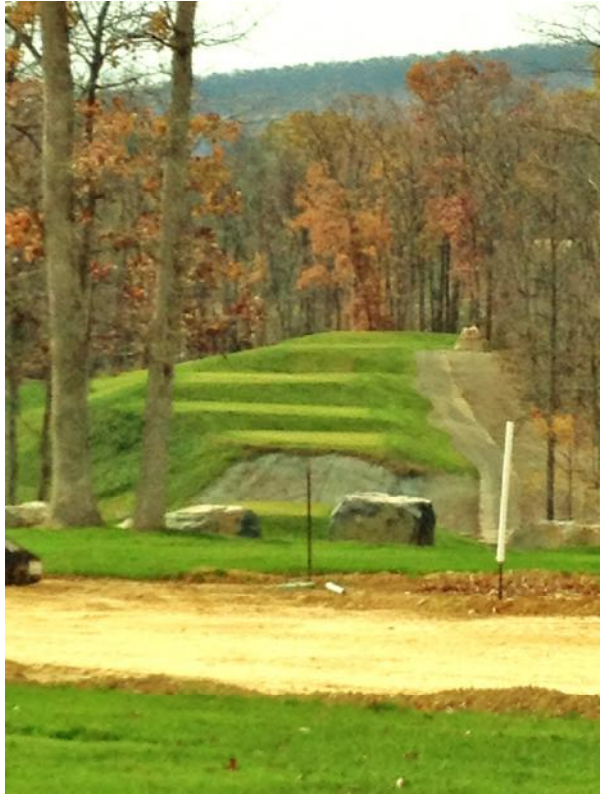
No. 7 of the Boulder showing the unfinished tee boxes in a stair-step fashion

So, to date, that has been the best answer I can give anyone on opening the new holes for play. And as always we are at the mercy of Mother Nature to be kind with the rain and sunshine to speed the process along.