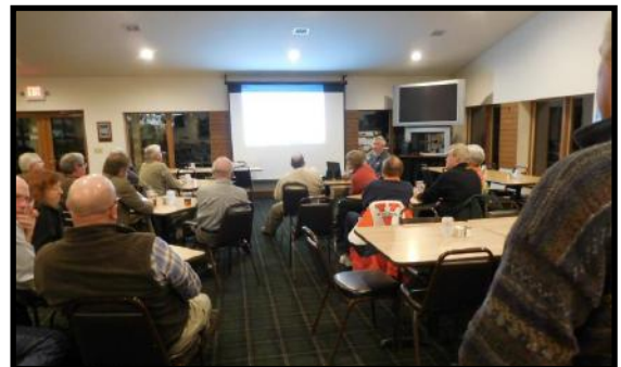
The Maintenance Talk, Wednesday, Jan. 20th