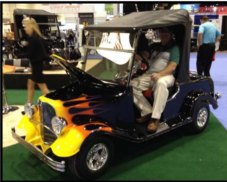
The golf show in Orlando Florida is always full of fun things to see and do. Our members sure would look classy driving these classic car golf carts around Rock Harbor.

We have a new Grill Facebook page, find us and like us to receive the daily lunch specials in your feed.