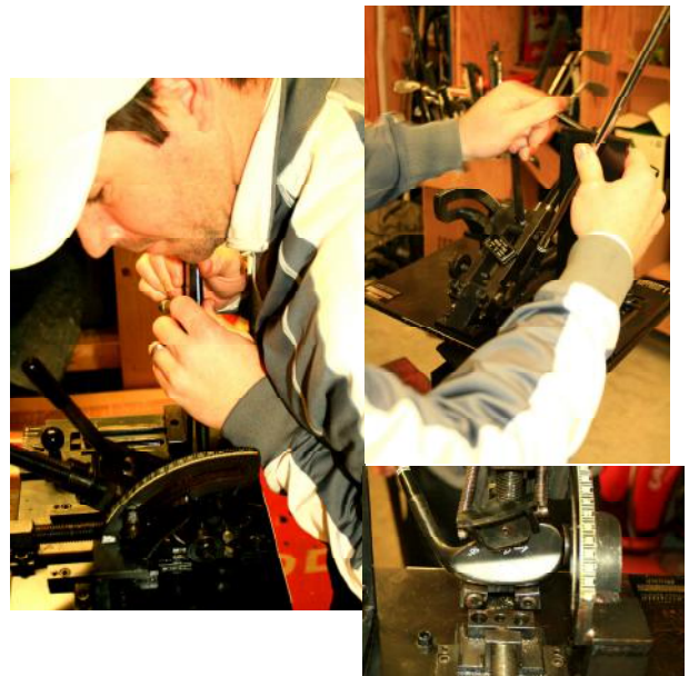
Call Cole Lee at the Pro Shop today for your "club tune-up".

Our Pro Shop staff can have you clubs fixed up and returned to you in about 30-40. This is also a great time to have the grips replaced on all your clubs for an overall tune up on your clubs in time for Spring golf.