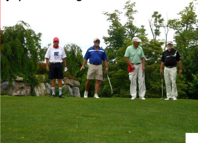
July 4th Outing