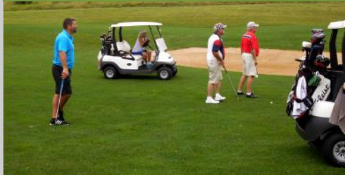
Glow Ball Event (6/25)