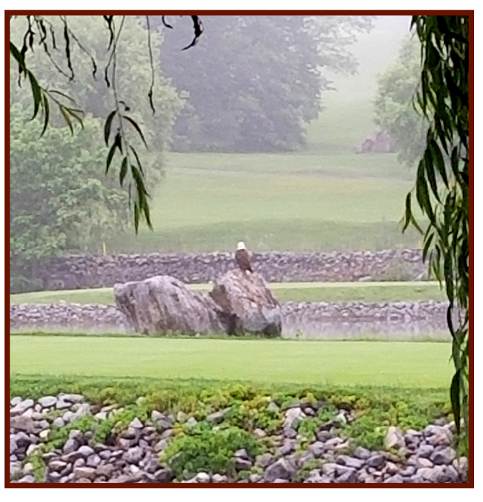
the mowers either haven't gotten to yet or just can't cut because an area is too wet is giving our course

have a couple more bunkers rebuilt before the tournament. The rest will be raked with several in what I consider unacceptable conditions, I will do my best to give you the best possible product with what we have at the time of the tournament.