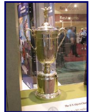
U.S. Open Trophy at the 2008 PGA Golf Show

So as usual I run the golf pool for the majors. The format will be 3 player aggregate scoring with 1 alternate player in the event you have a player miss the cut. Each entry is $5.00 as before. I will need the entry the Wednesday before the tournament begins. Good Luck to everyone and happy Father's Day!