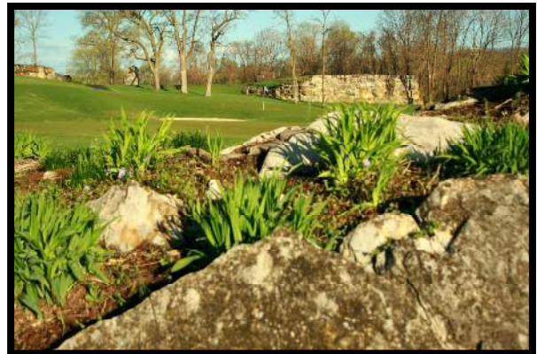
With the early spring we are already beginning to see the Day Lilies pop out of the ground.

Our membership remains a vital source of our sustenance. As part of our continued efforts to garner additional members, we created supplemental memberships: The Business/Corporate Membership and the new Out Of Area Membership. The referral commission is still in effect for those who bring in new members.