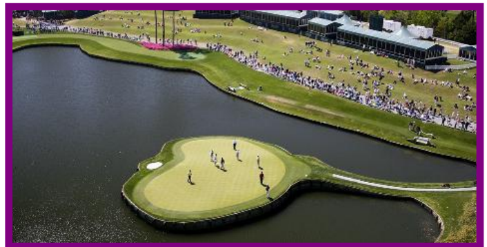
The TPC at Sawgrass, the island green, par 3 seventeenth.

1974—and why they have spent so much time and treasure promoting it as the "Fifth Major." The purse for the Players Championship is the largest purse in golf, $1.8 million to the winner. The tournament also counts for as much as the traditional four Majors in the FedEx Cup points standings. It is worth 80 points in the World Golf Rankings, while the majors are worth 100. The winner of the tournament receives a five