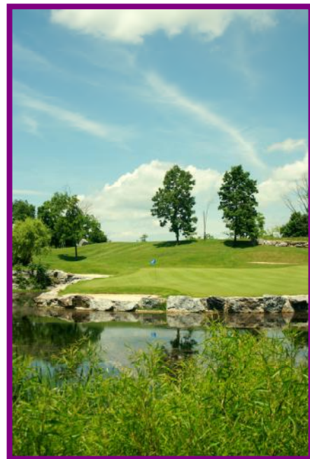
Boulder No. 16

We are in the process of over seeding the tees on the Boulder Course and a few of the tees on the Rock Course. We have also started spraying the fairways and rough areas for clover, dandelions and crabgrass curative as a preventative measure.