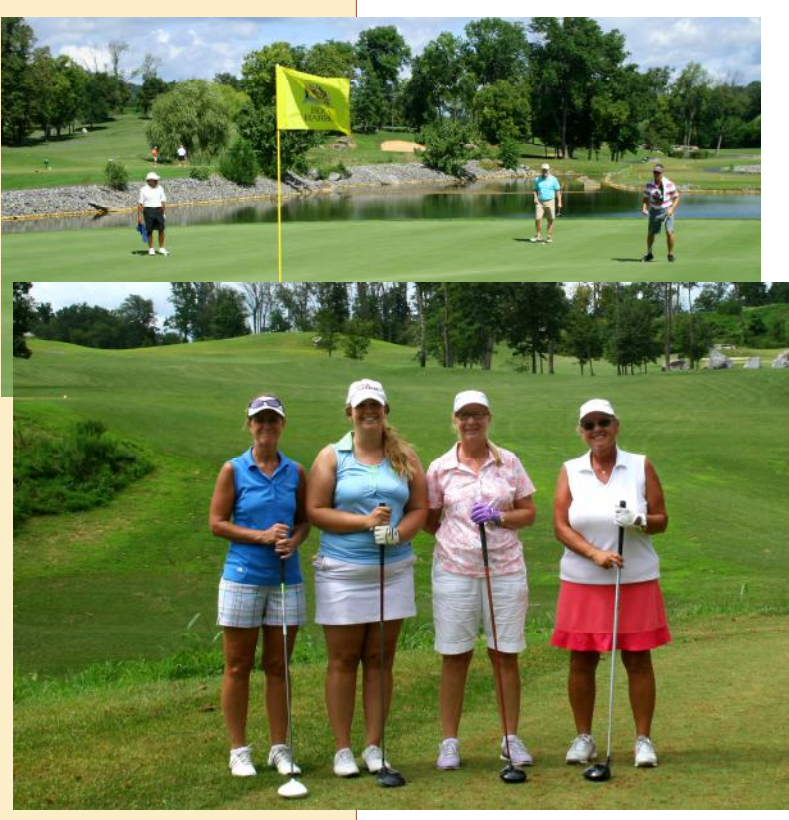
Ladies representation for the Club Championship