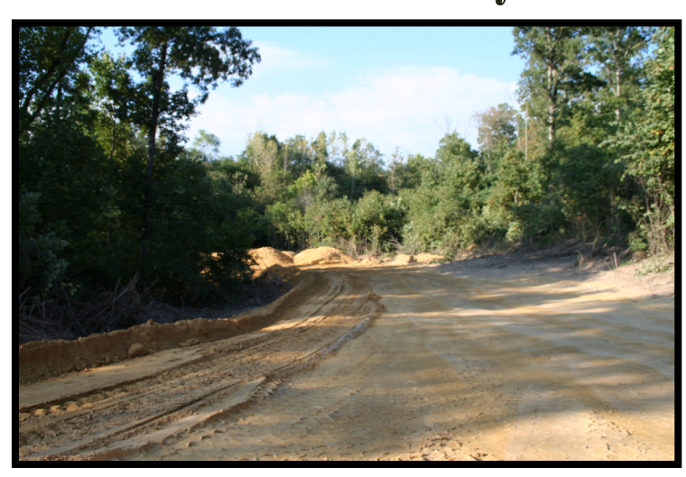
This picture was taken in September of 2013. Can you guess which hole it is now?