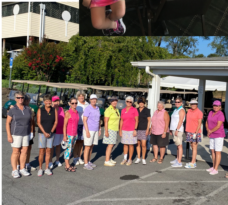
2020 Ladies Wednesday Ladies League