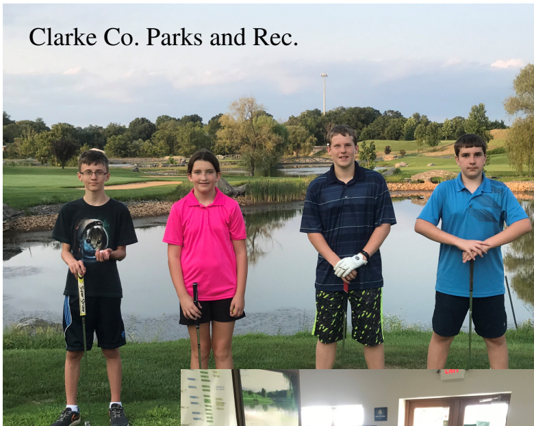
Clarke Co. Parks and Rec.