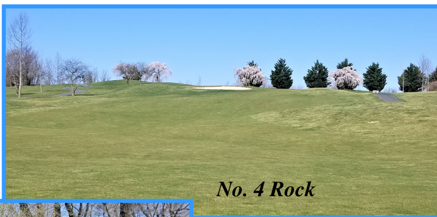
No. 4 Rock