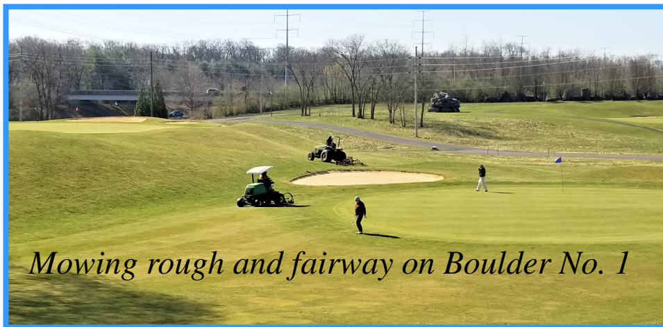
Mowing rough and fairway on Boulder No. 1

Again thank you to everyone for the kind words during my recovery.