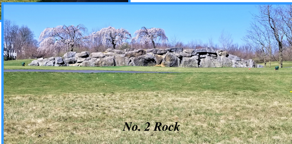
No. 2 Rock