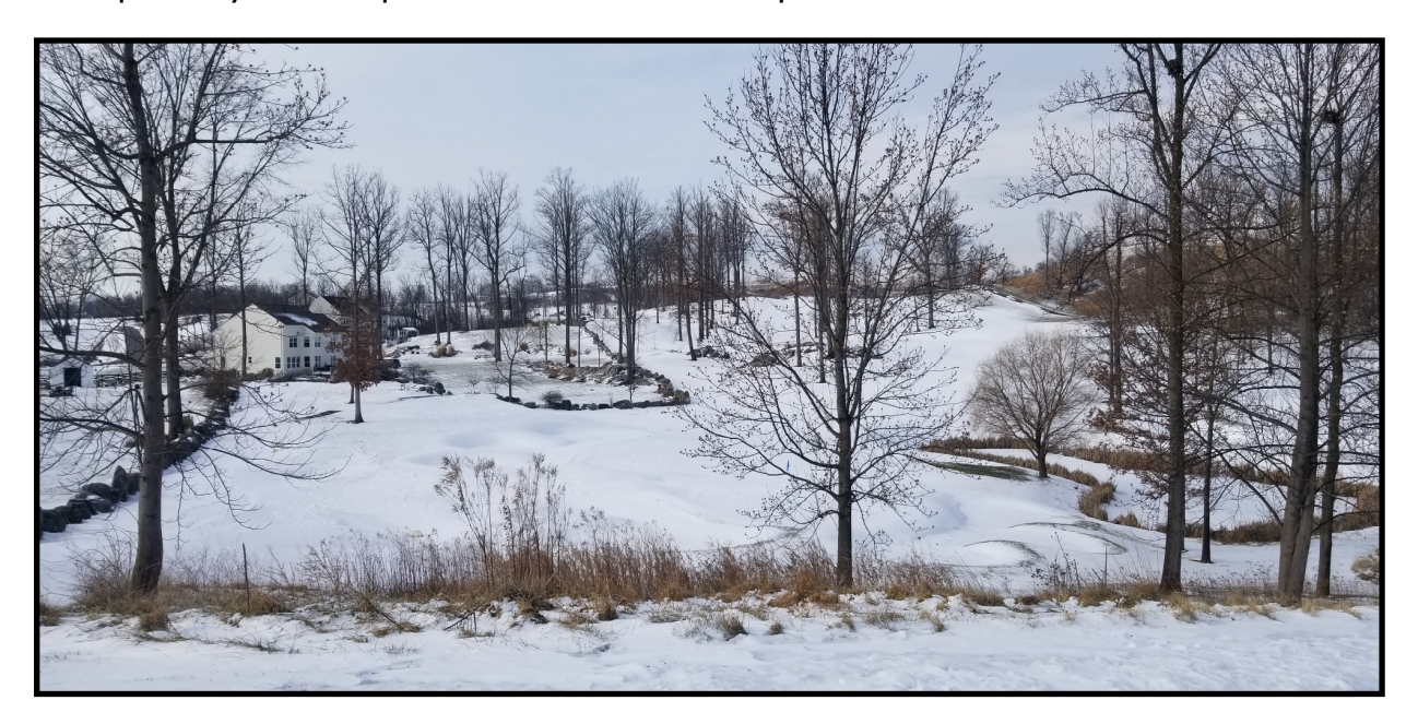
In case you haven't been on the course for a while and you are wondering what it looks like, here is a sneak from the eyes of Chris Dieter. Boulder 9. See the Insert, page 4 for more winter snow pictures of the course.

Again...stop me anytime for questions, criticisms, or compliments,