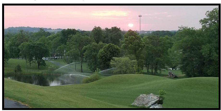
As always, feel free to stop me for any reason.

In the end, we are trying to keep everything as beautiful and playable as possible for your golfing enjoyment. (Picture Below: Sunrise and sprinklers – a great site to me)