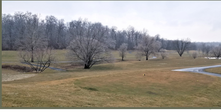
Boulder 10, ice covered.

To subscribe or unsubscribe to this free newsletter send an e-mail to mistyautumn@comcast.net Questions/Comments or Suggestions welcomed