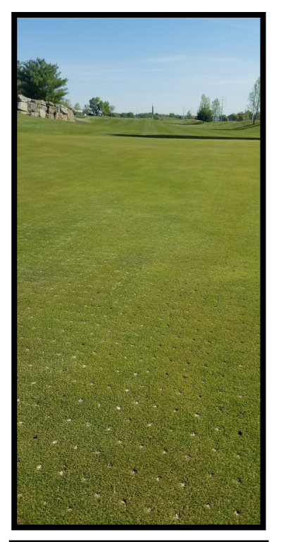
Boulder No 1, aerification complete.