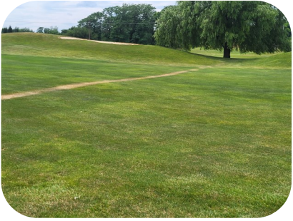
Drain line drying out on Boulder I, pictured below.